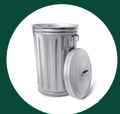
DIVERTED FROM LANDFILL (CUBIC YARDS)